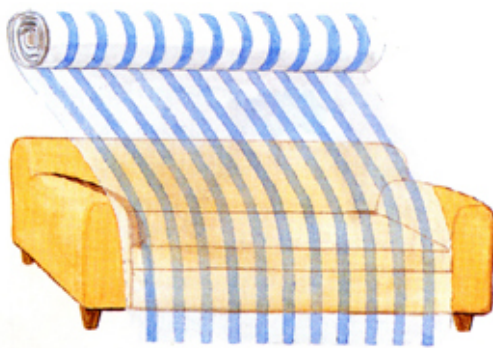
fabric applied regularly

Railroading refers to the way a fabric, usually a pattern, is milled. Normally a bolt of fabric features the top of a pattern going up the roll. However, a railroaded fabric will have the top of the pattern going across the roll. This provides a continuous roll of the pattern, making it possible to upholster a large sofa, cushion, or draperies without creating seams or a break in the pattern.